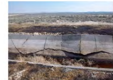
Badly degraded canal structure.