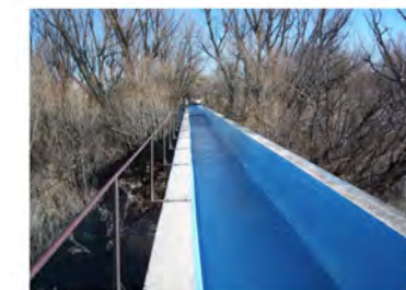
Long lasting seal to restore structural integrity.